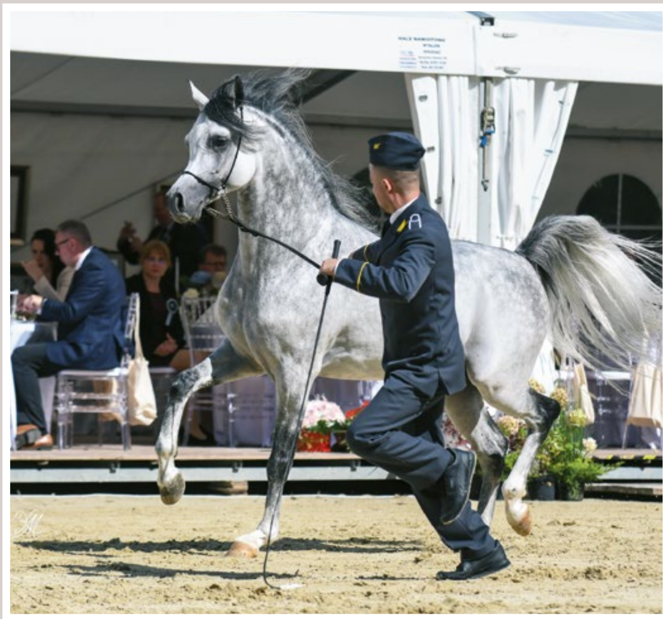
PTOLEMEUSZ (ZŁOTY MEDAL X PARMANA)