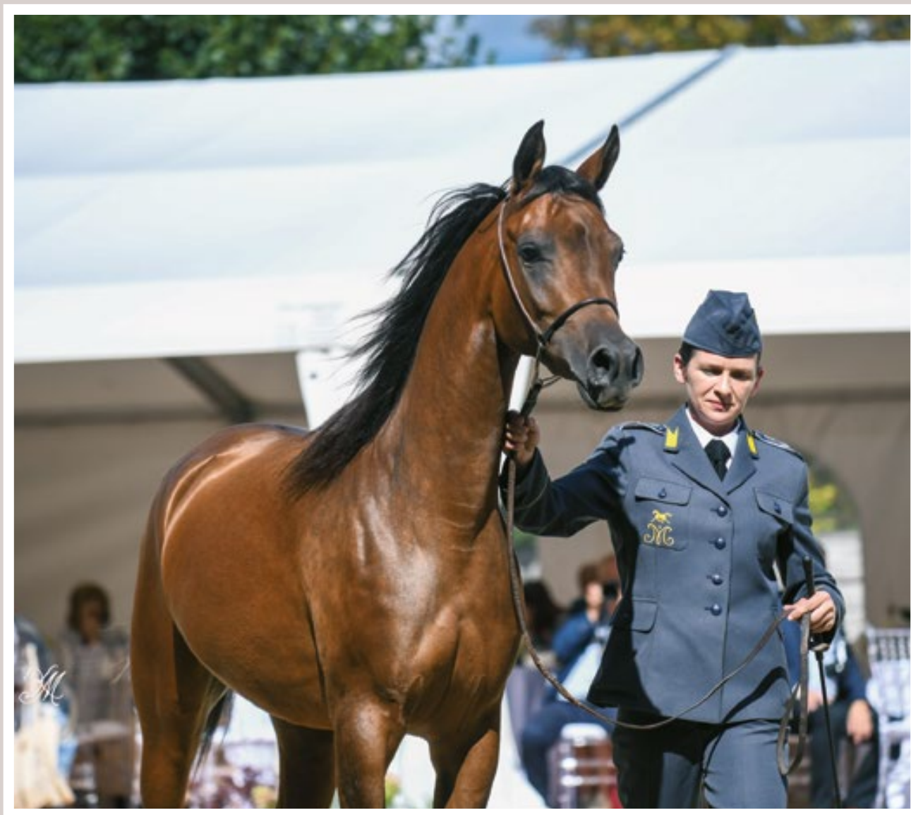
ZŁOTA AURA (MORION X ZŁOTNA)