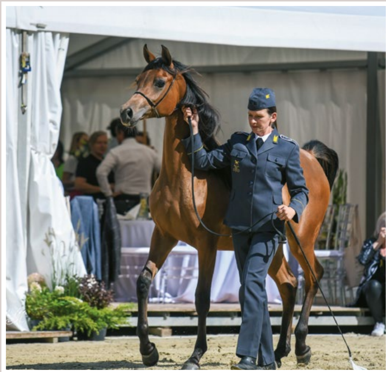
PUSTYNIA WIKTORII (DOMINIC M X PUSTYNIA KAHILA)