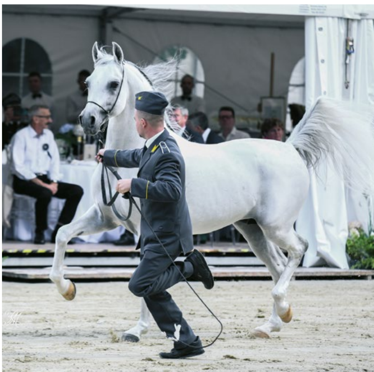
ZŁOTY MEDAL (QR MARC X ZŁOTA ORDA)