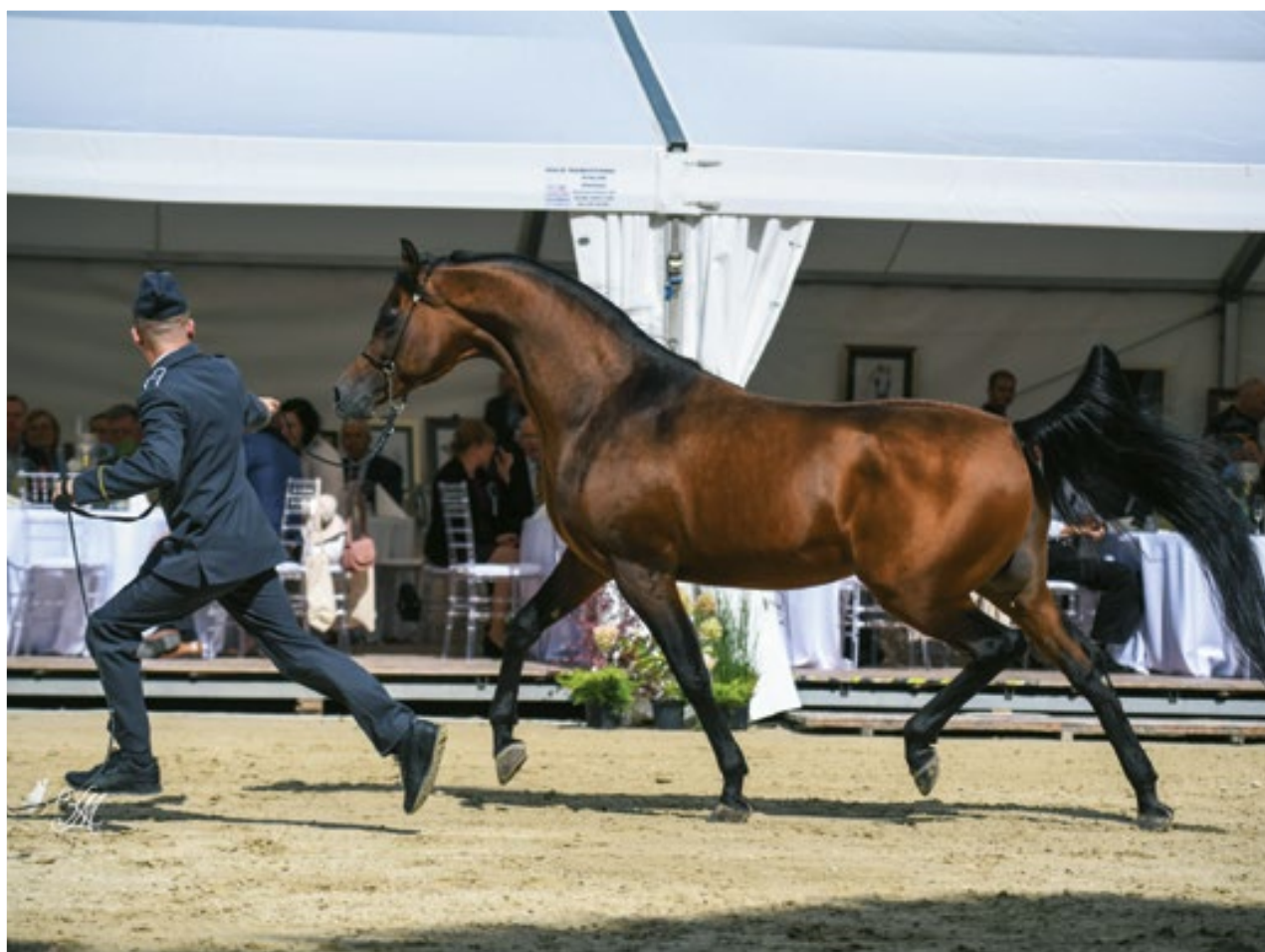
MORION (KAHIL AL SHAQAB X MESALINA)