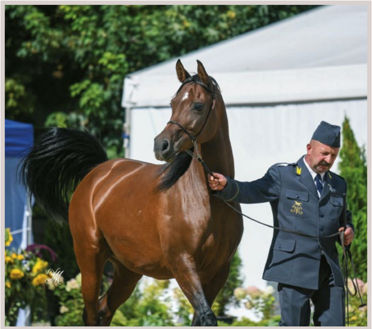
TEMPRA (EKSTERN X TENERYFA)