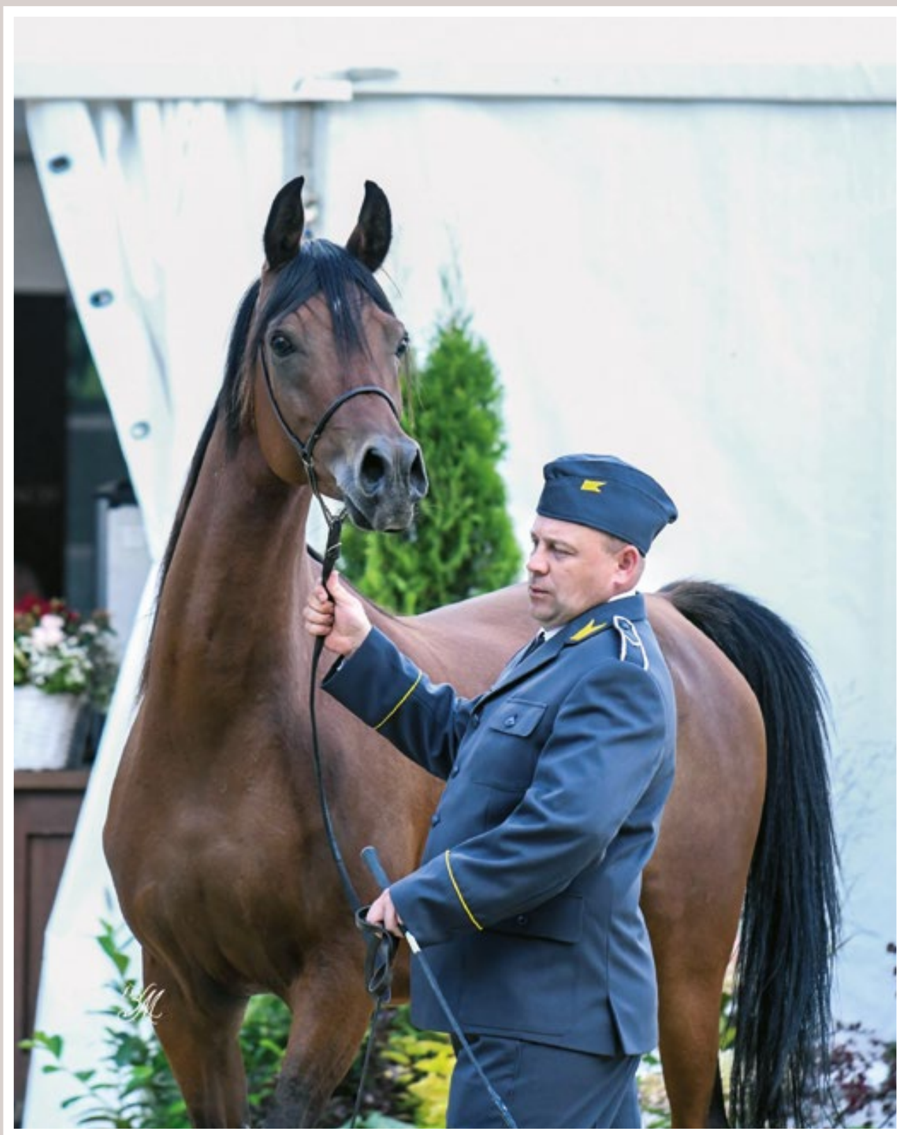
DIANORA (VITORIO TO X DIARA)